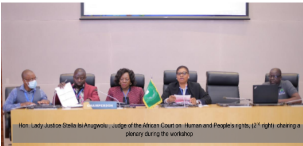
Hon. Lady Justice Stella Isi Anugwolu , Judge of the African Court on Human and People's rights, (2 nd right) chairing a plenary during the workshop