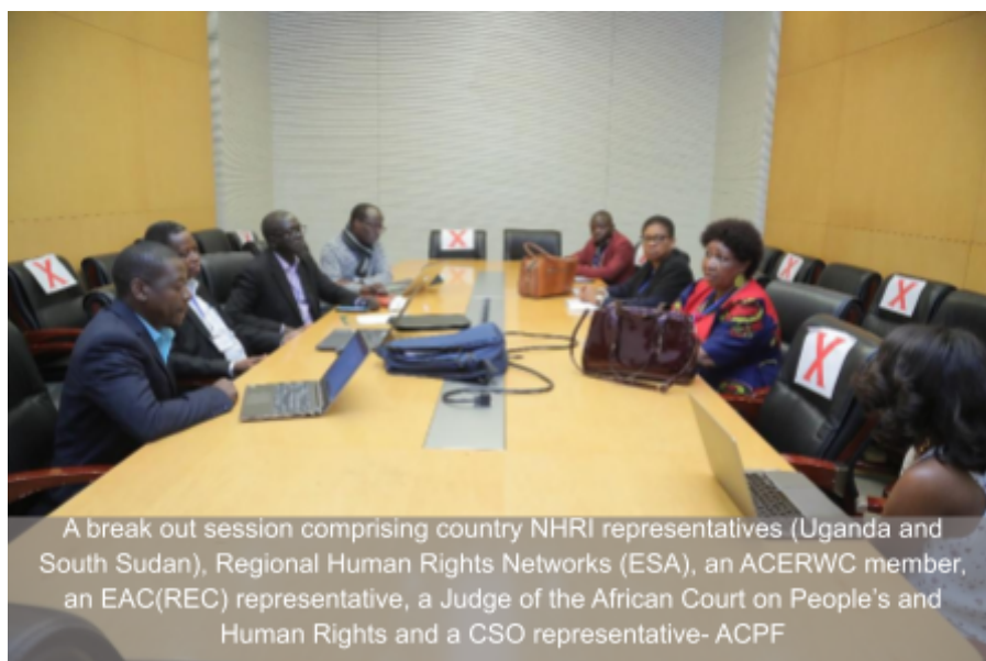
A break out session comprising country NHRI representatives (Uganda and South Sudan), Regional Human Rights Networks (ESA), an ACERWC member, an EAC(REC) representative, a Judge of the African Court on People's and Human Rights and a CSO representative- ACPF