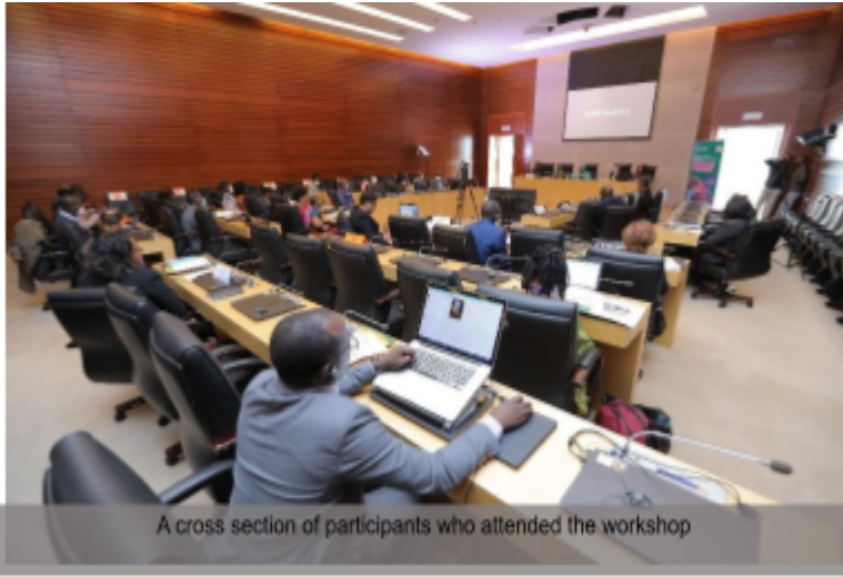
A cross section of participants who attended the workshop