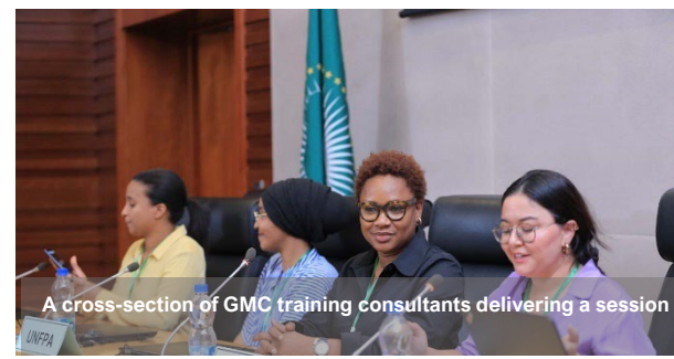
A cross-section of GMC training consultants delivering a session