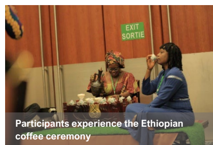
Participants experience the Ethiopian coffee ceremony