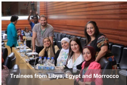
Trainees from Libya, Egypt and Morocco