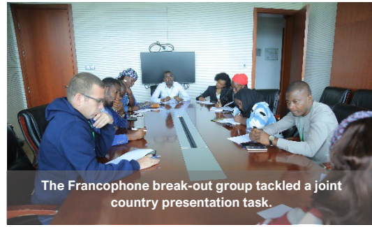
The Francophone break-out group tackled a joint country presentation task.